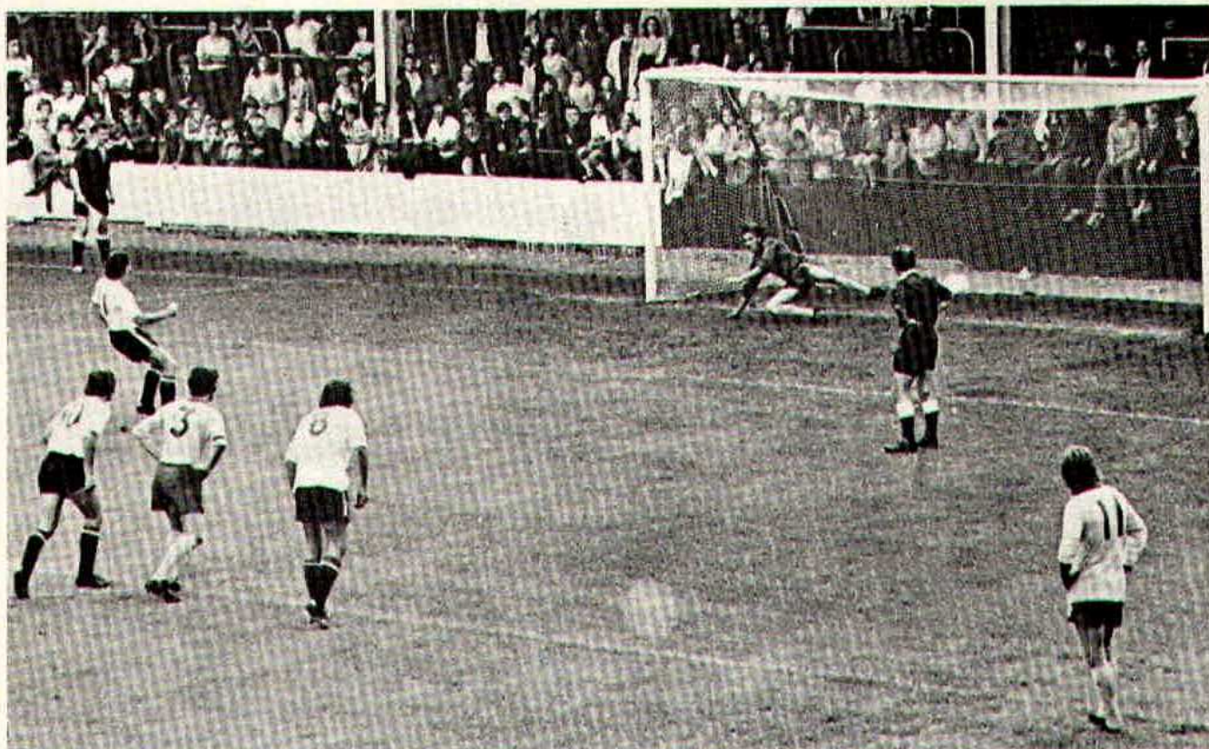
Don Rogers sends the Southampton 'keeper the wrong way from the spot.